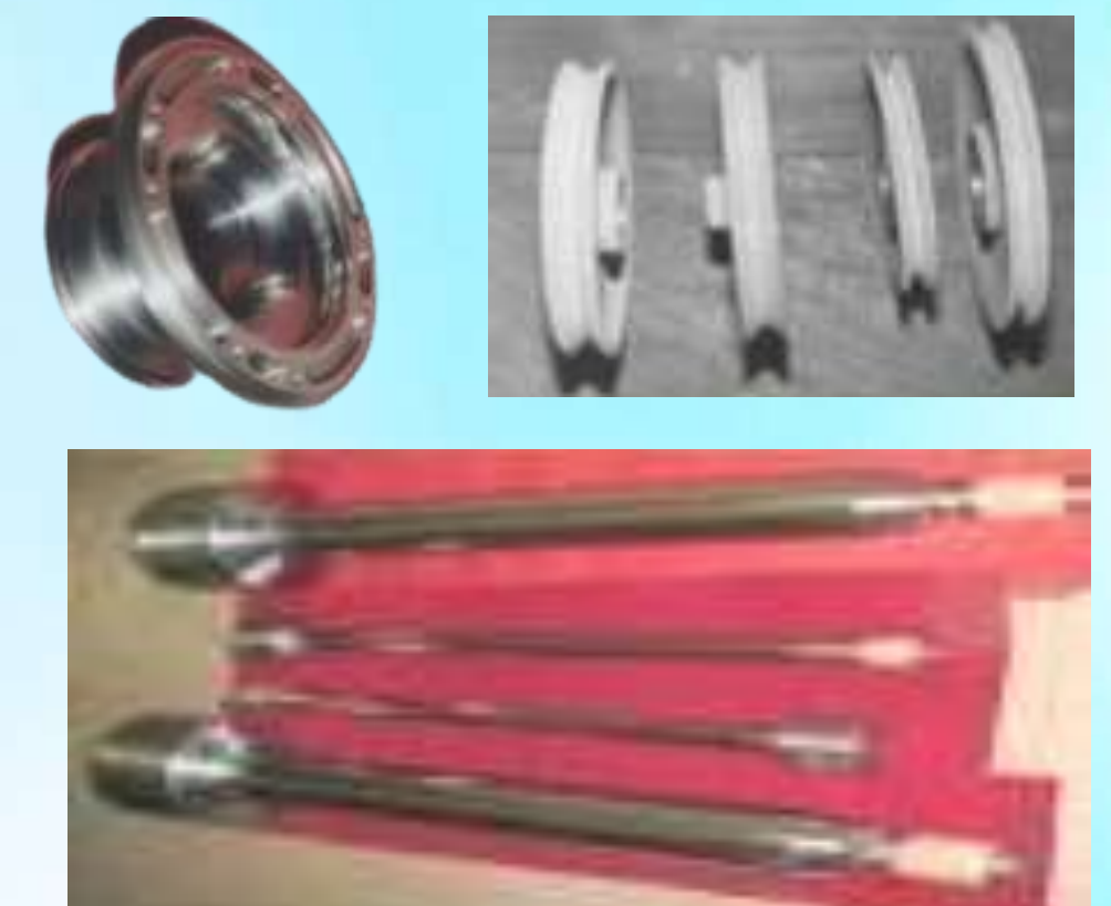
DSC Coated Industrial Components