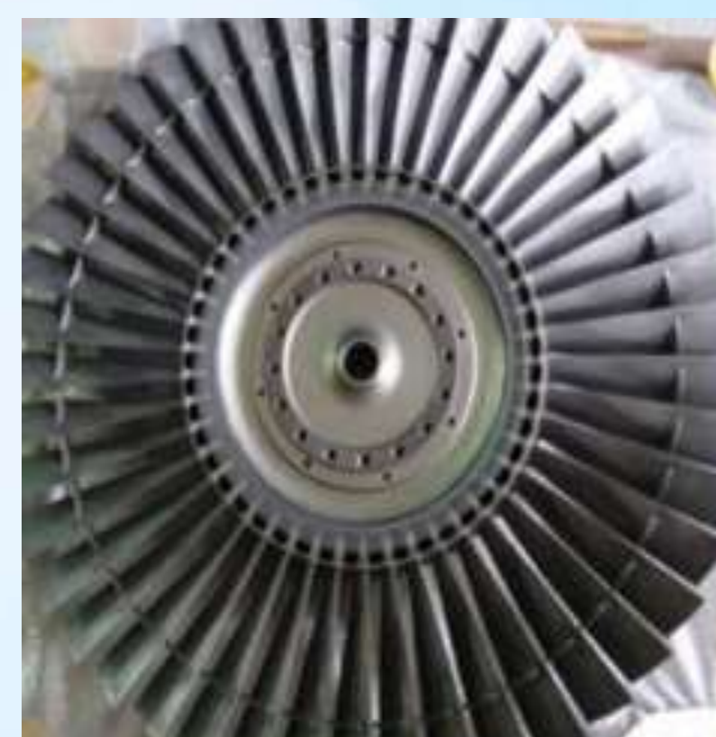
Detonation Spray Coated LPC III Modules for Naval Aircraft