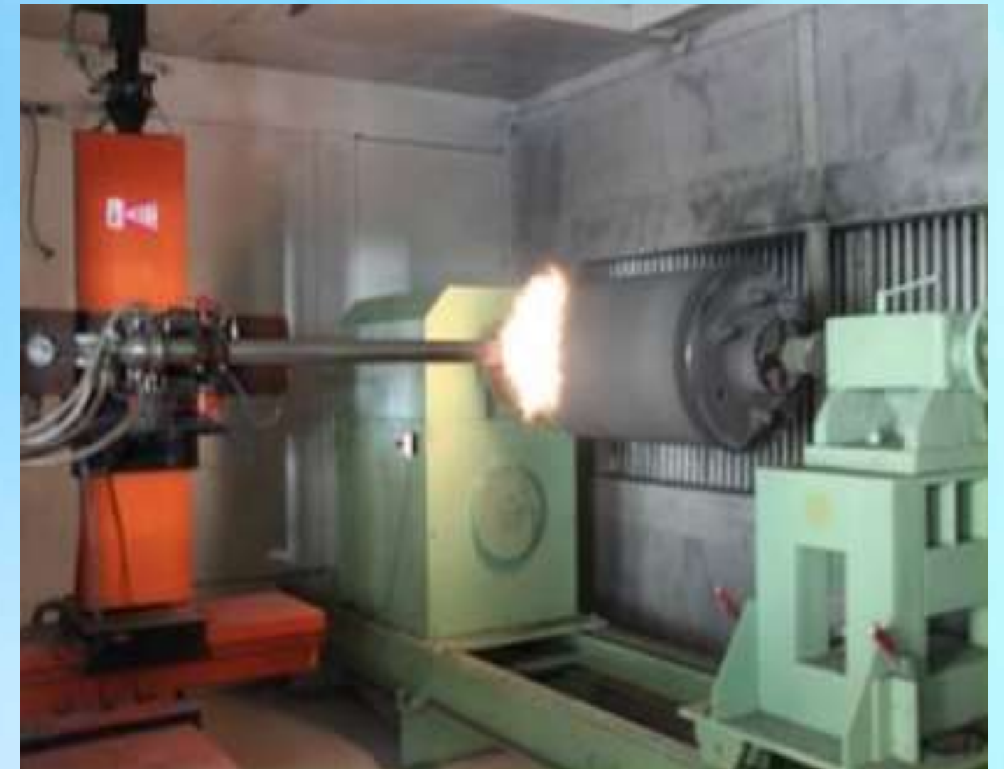
Detonation Spray System